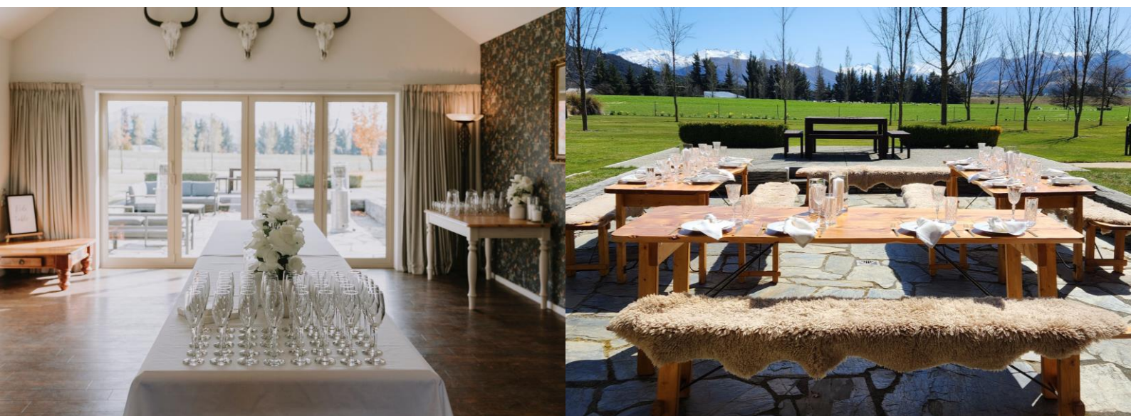
Casual, intimate wedding set up