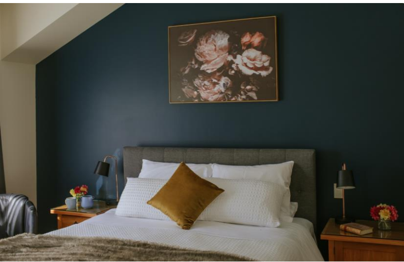
Maple Lodge starting to show its autumn glory