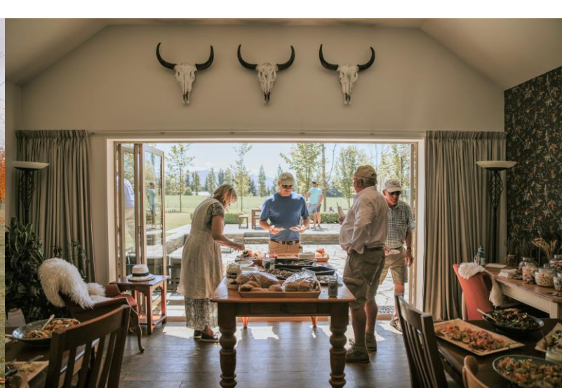
Relaxed, intimate autumn wedding