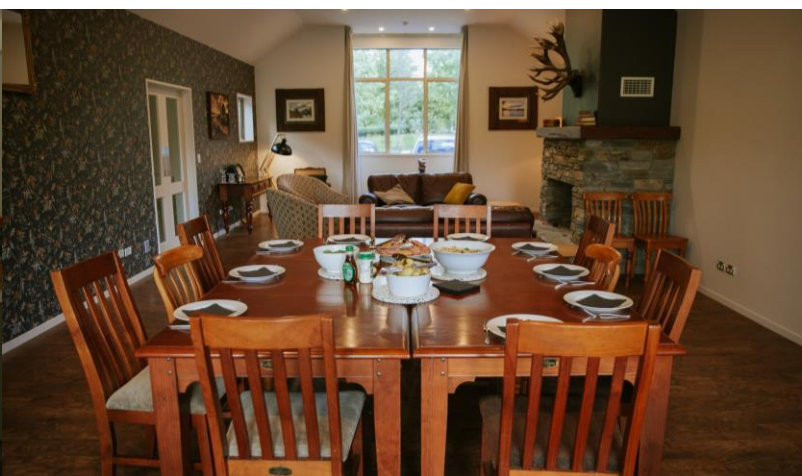
The main dining and lounge