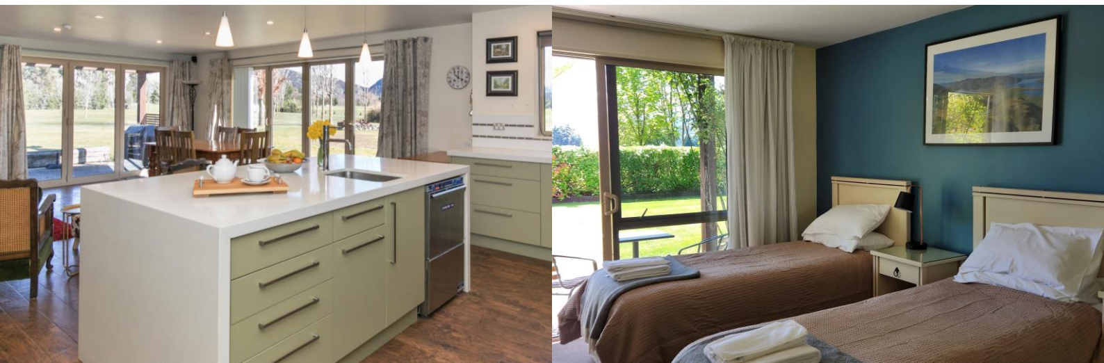
Kitchen with second living area